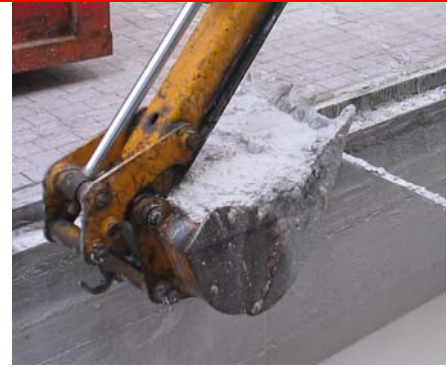
PITS FREQUENT CLEANING