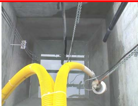
ALWAYS CLEANED PITS AND GOOD QUALITY WATER