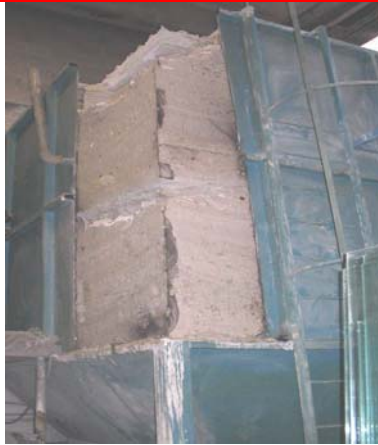
FULLY OBSTRUCTED TANK